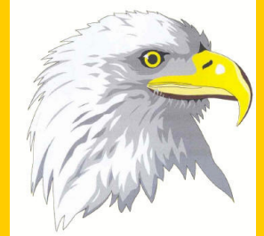
Home of the Eagles!